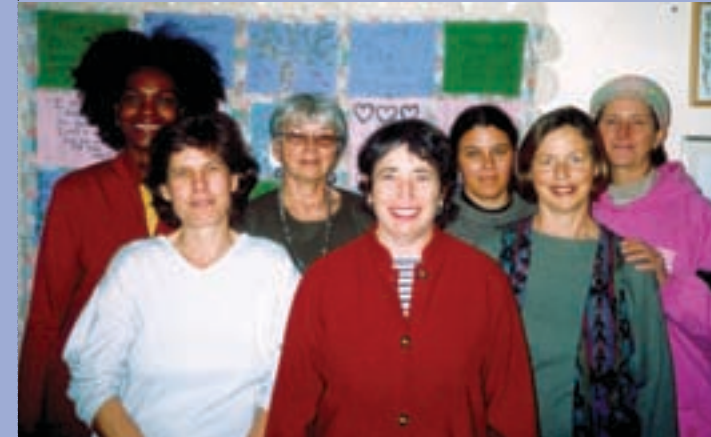
One of our In-Home Comfort Care Team practitioners will come to your home to provide CMCC's services

First you will speak with CMCC's Social Worker. She will help you decide if it is the right time for you to take advantage of the In-Home Comfort Care Program (IHCC).