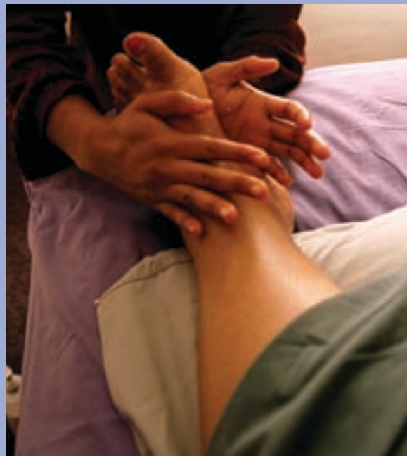
CMCC will provide type of service based on practitioner availability

The CMCC practitioners responsible for your services will be assigned to you in teams of 2–3 women. You will see one practitioner from your team each week.